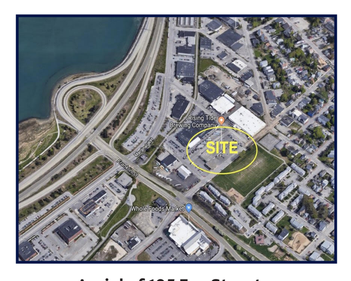
Aerial of 105 Fox Street